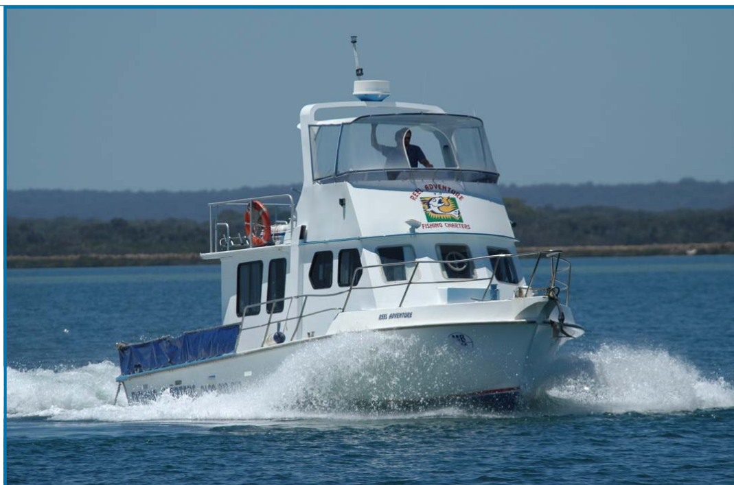
Phil at Reel Adventure helm & charter customers display a Snapper and a Mulway.

Members of Yaringa Fishing Club proudly display their catches at weigh-in during the 2005/6 fishing season. (More pictures appear on Page 5 including catches from the 2006/7 fishing season at Yaringa boat ramp) John & Maliney at Yaringa Chandlery & Boat Sales provide weigh-in facilities on Comp Weekends. Phil Wasnig of Reel Adventure Fishing Charters is major sponsor of Yaringa Fishing Club.